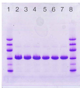
Figure 2: SDS-PAGE, PHA-L. One visible band at 31 kDa. Lane 1 and 8: MW marker Lane 2-7: Lot specific PHA-L